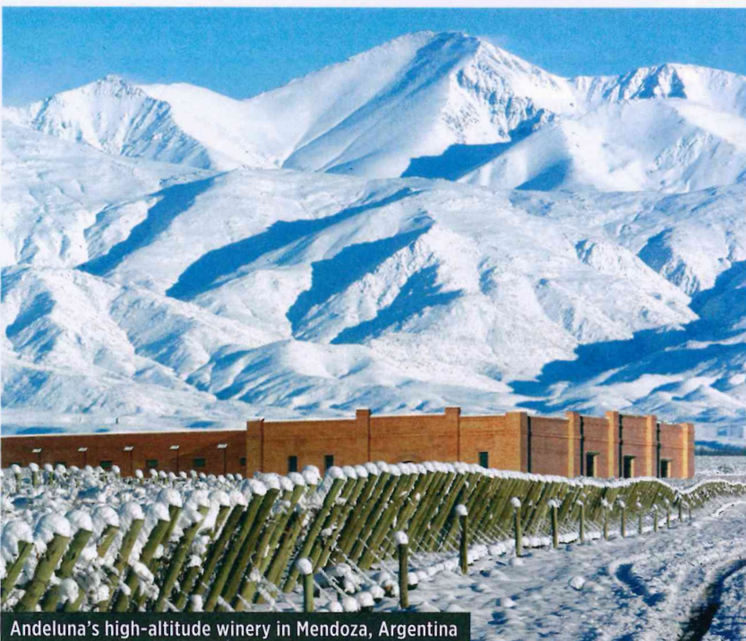
Andeluna's high-altitude winery in Mendoza, Argentina